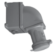
100 and 150 Amp